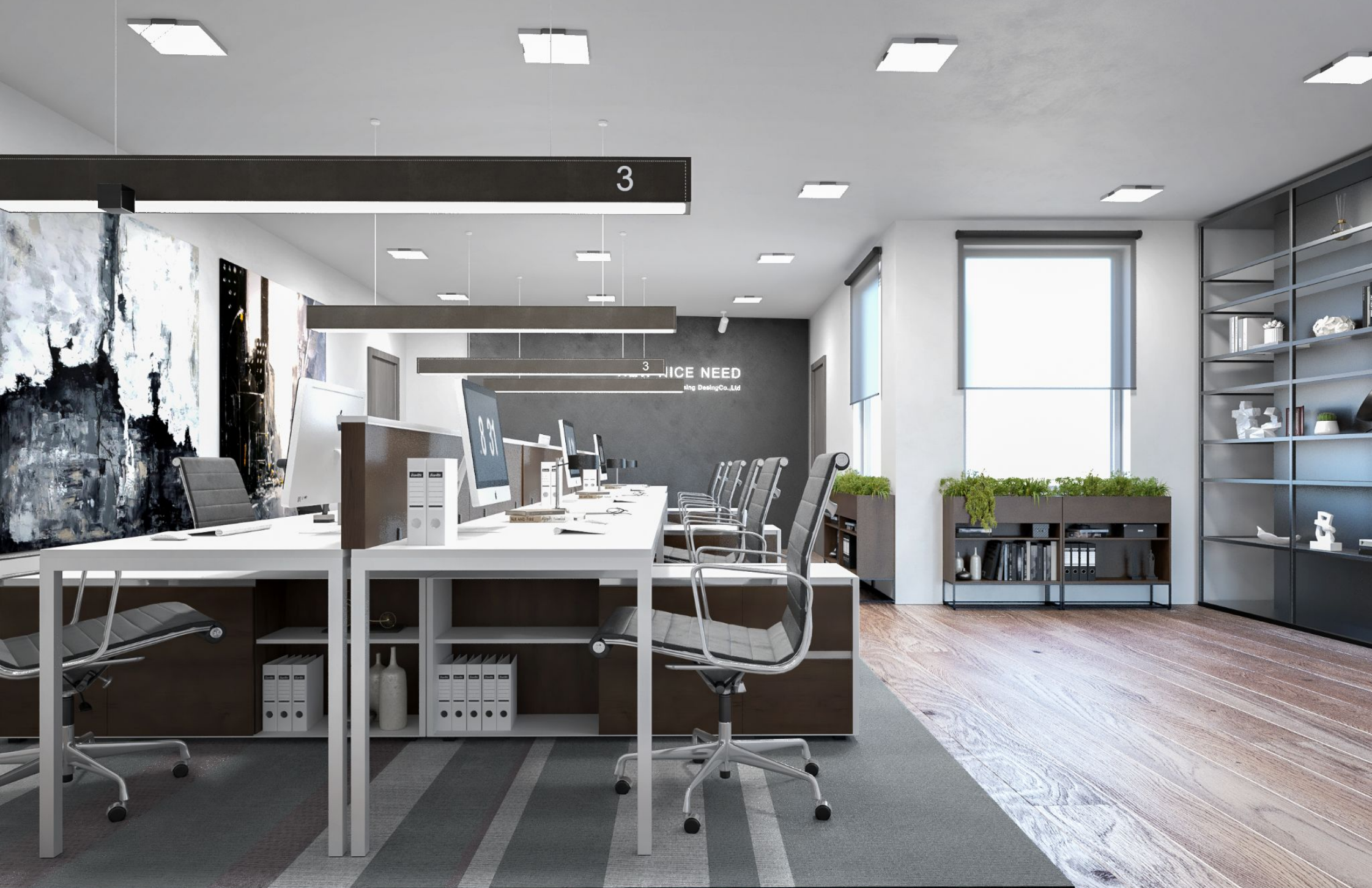
Class 4A Offices