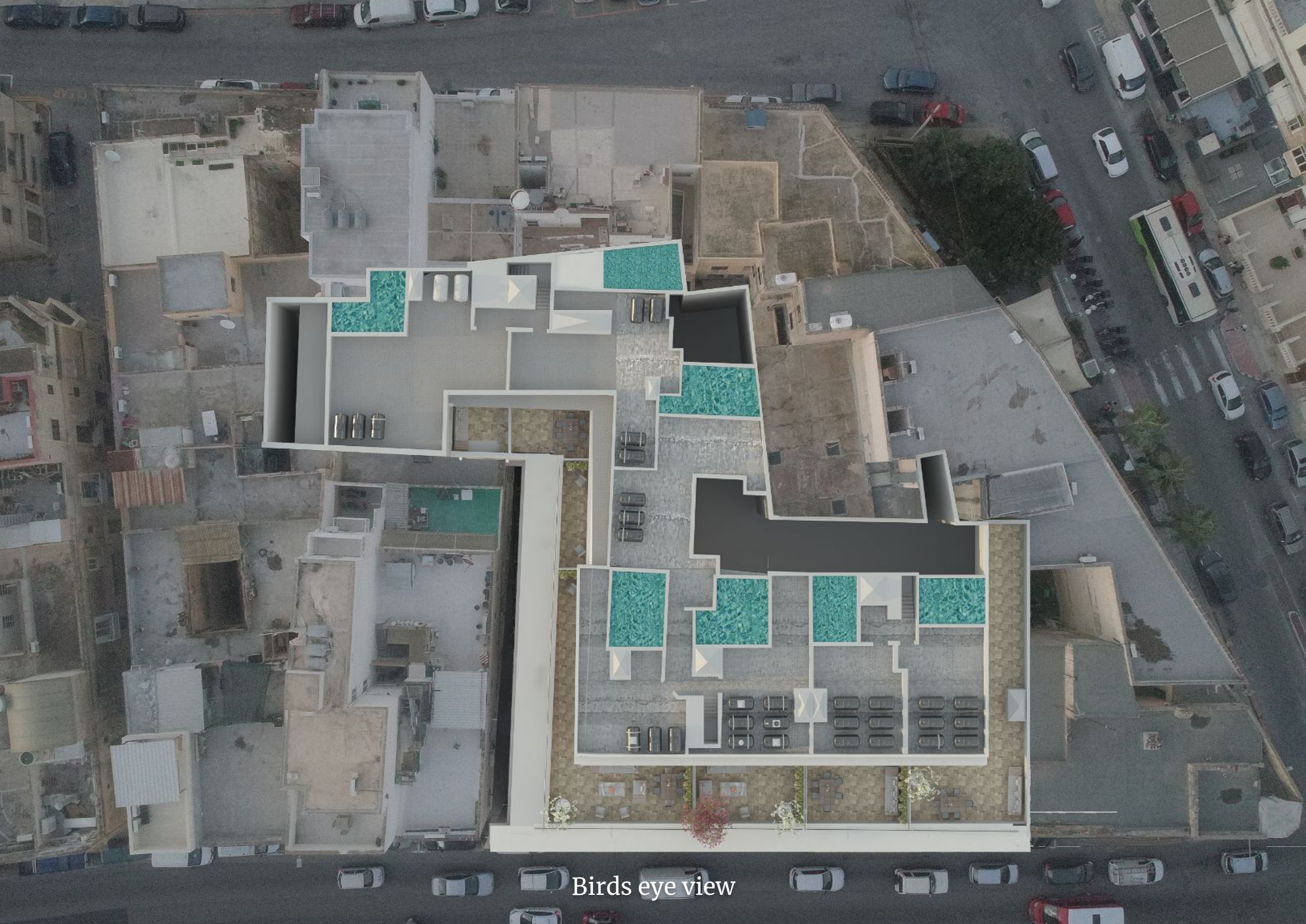
Birds eye view