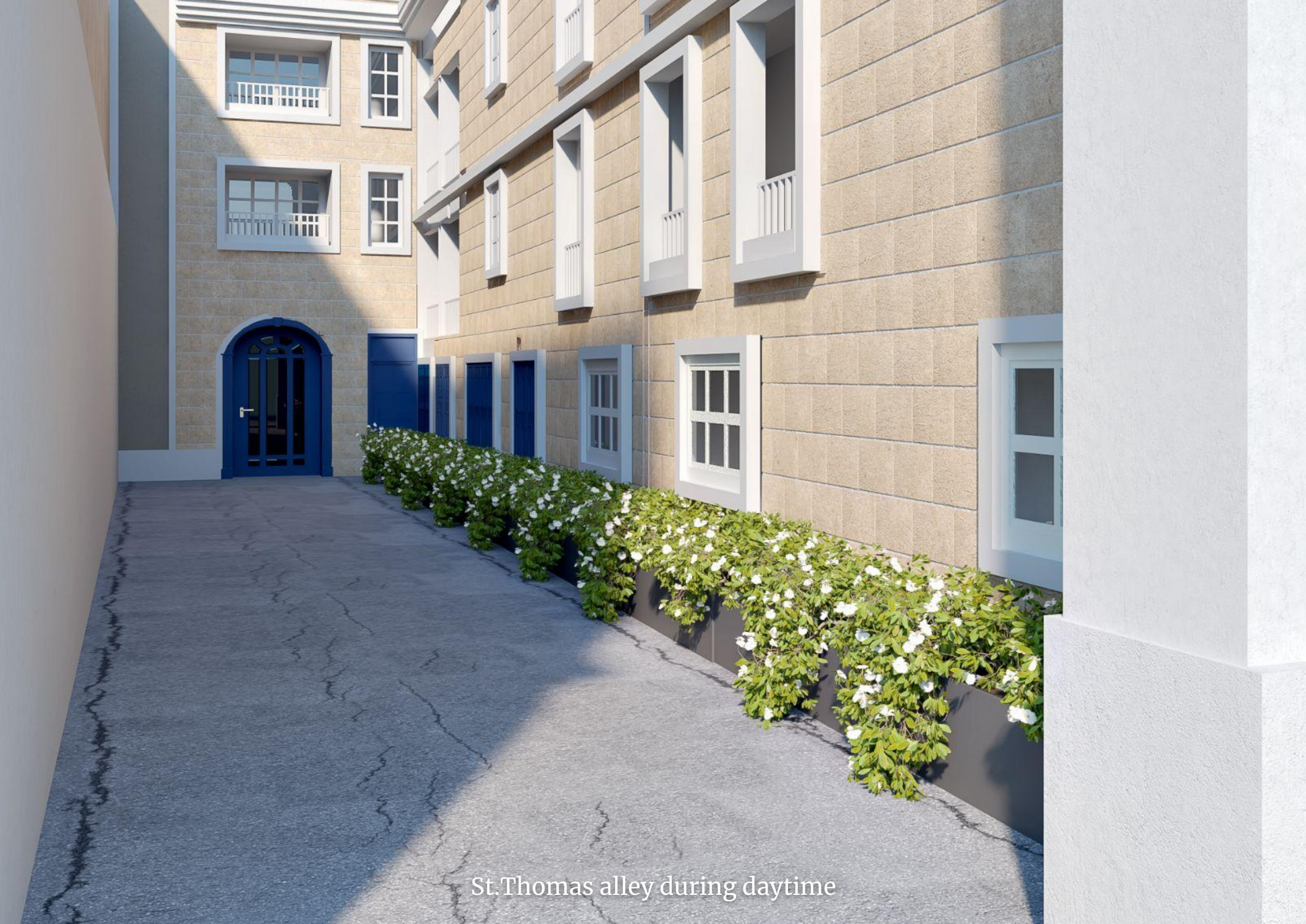
St.Thomas alley during daytime