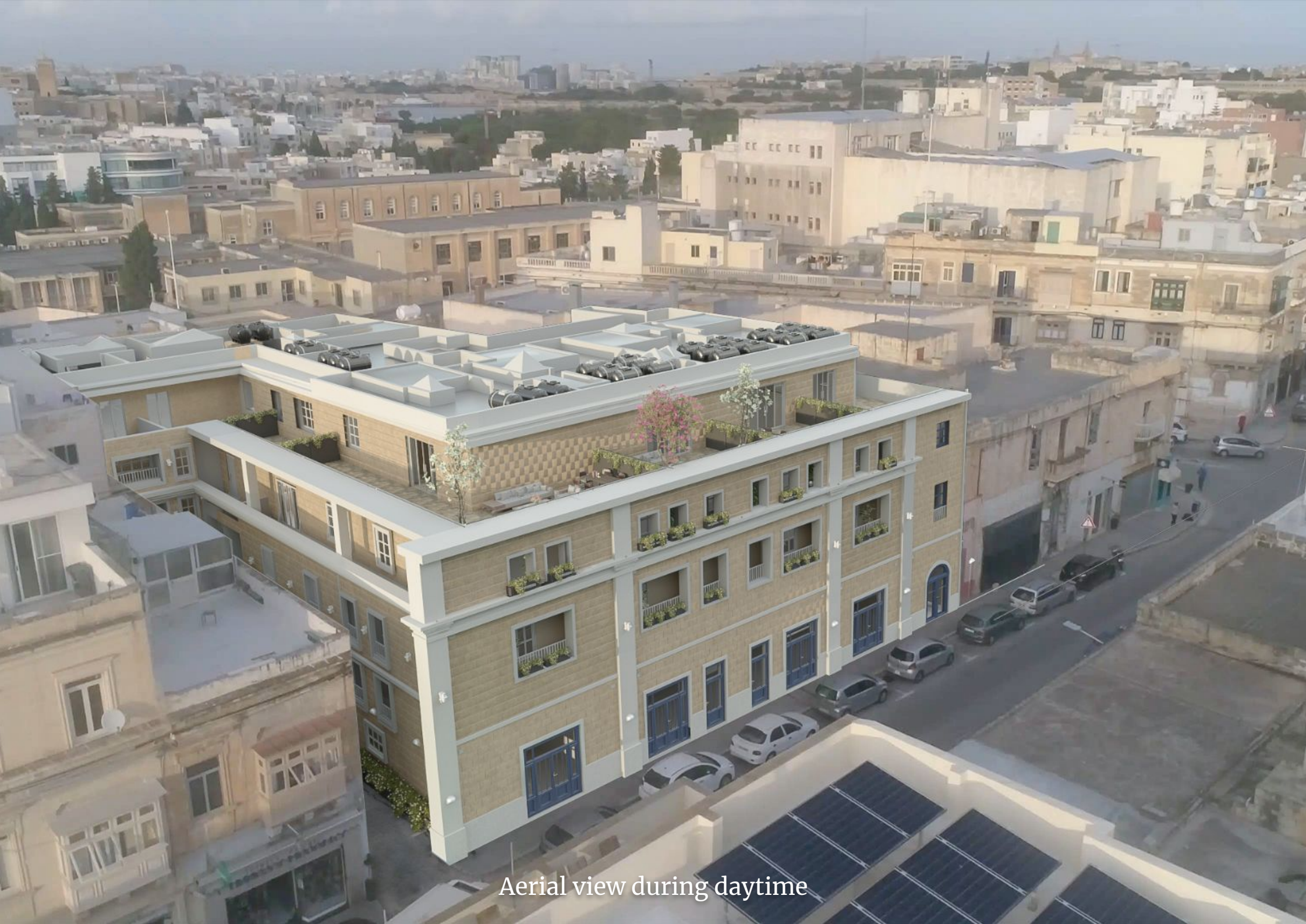
Aerial view during daytime