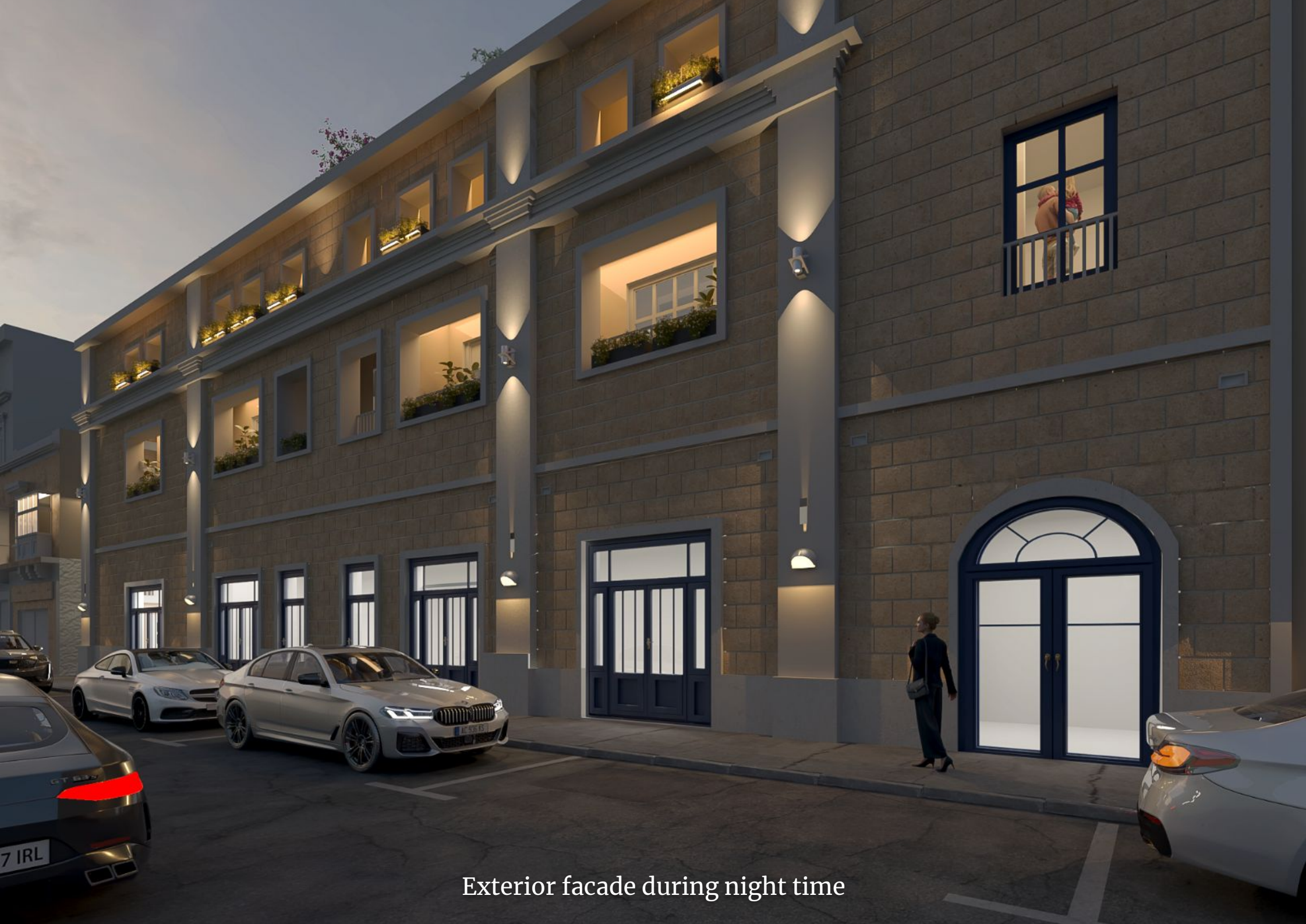
Exterior facade during night time