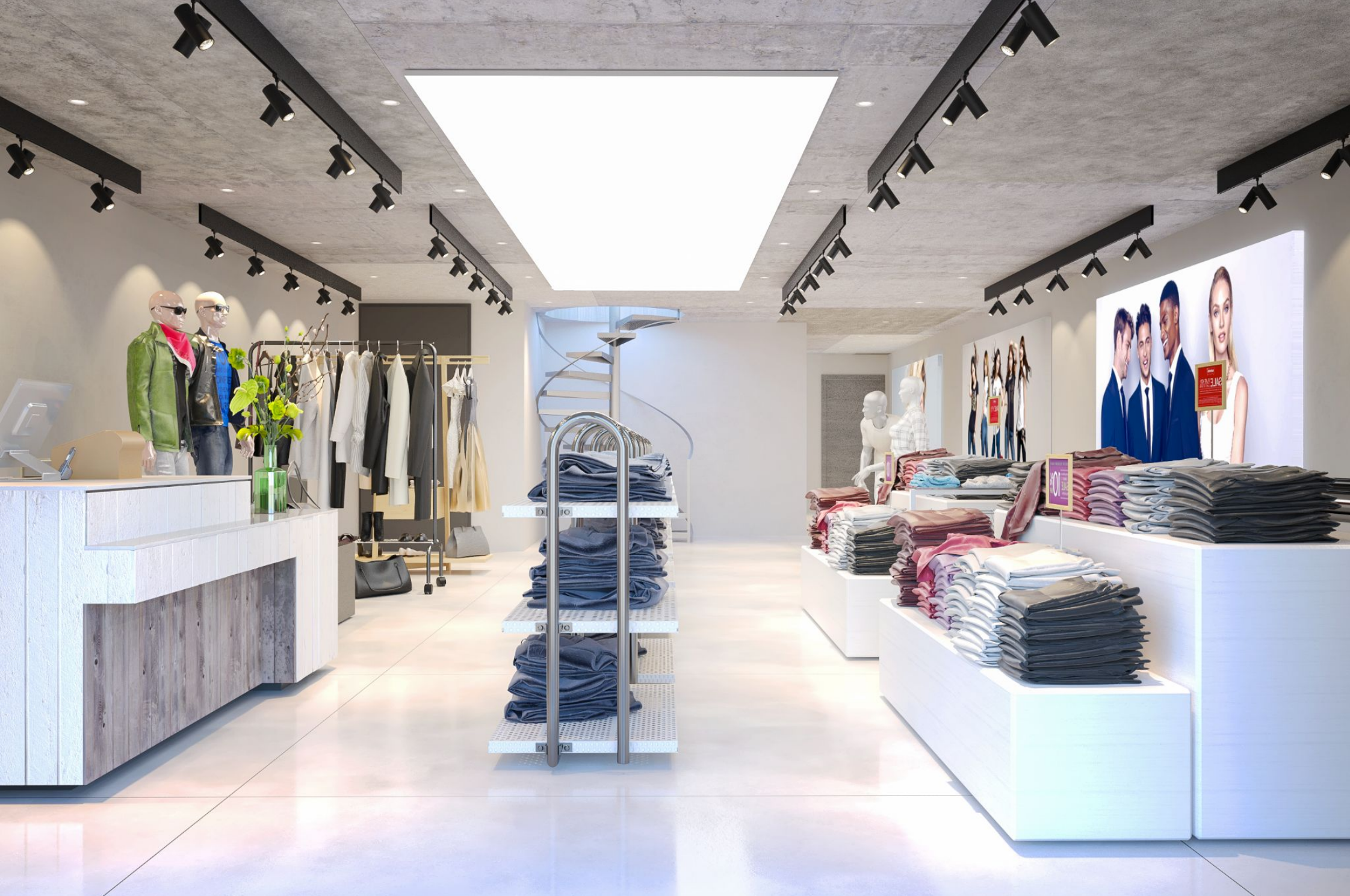
Class 4B Retail Shops