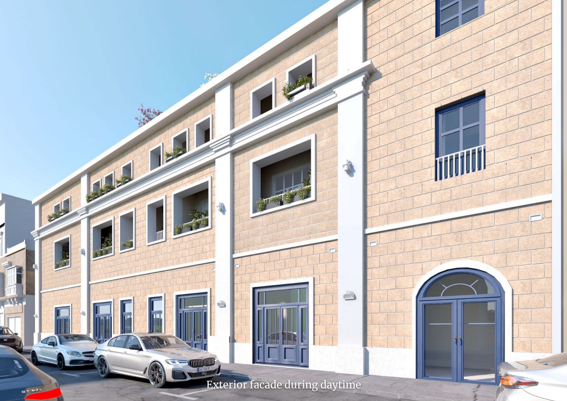
Exterior facade during daytime